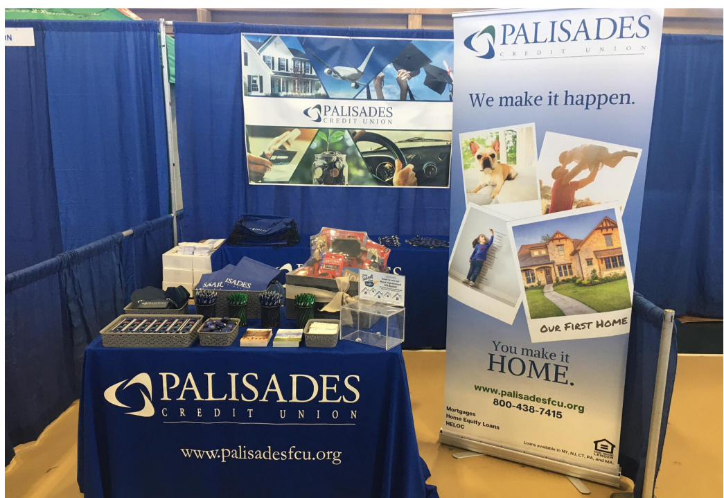
Palisades Credit Union Booth at the Suburban Home Show